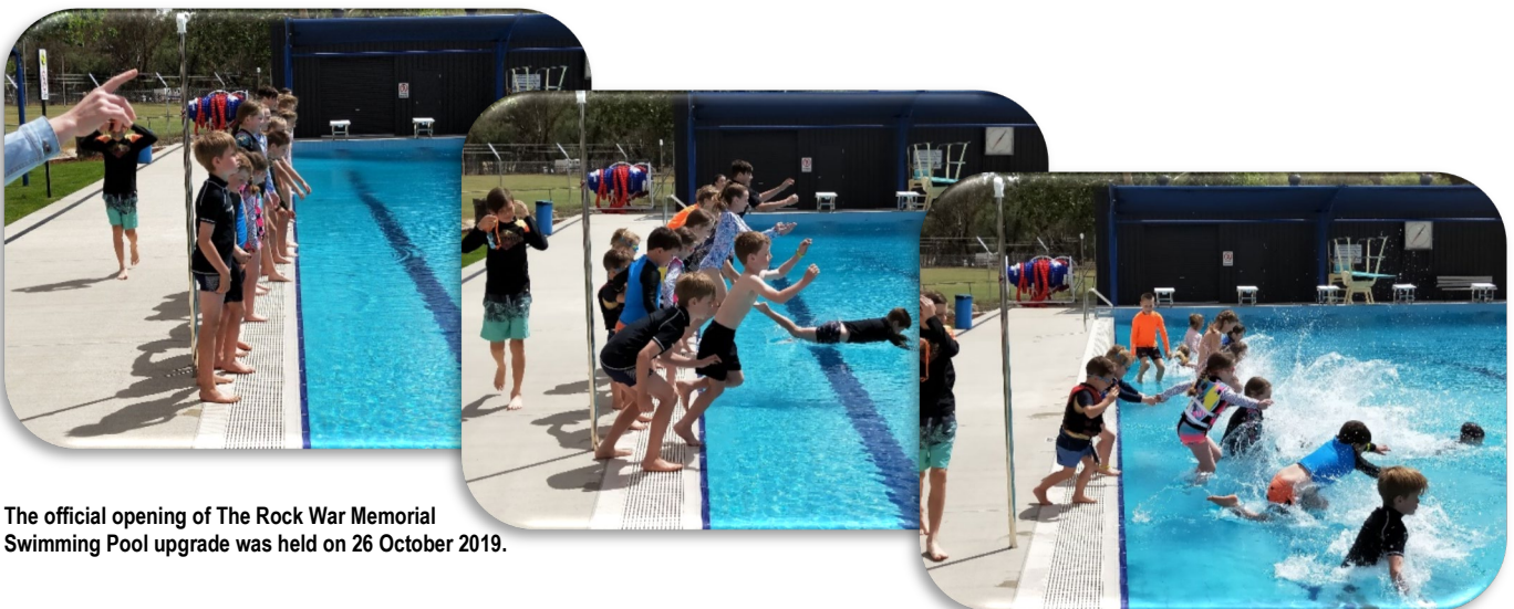
The official opening of The Rock War Memorial Swimming Pool upgrade was held on 26 October 2019.