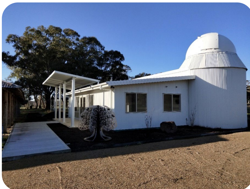
Astronomical Observatory, The Rock