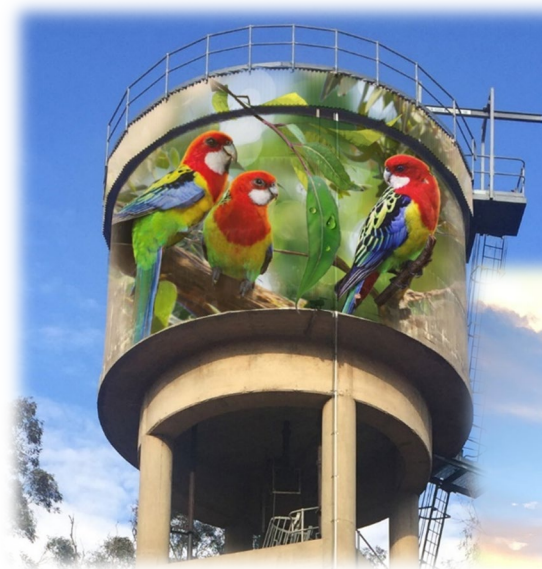
Milbrulong Water Tower