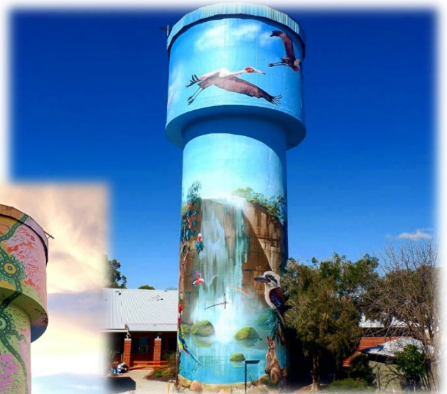
Lockhart Water Tower