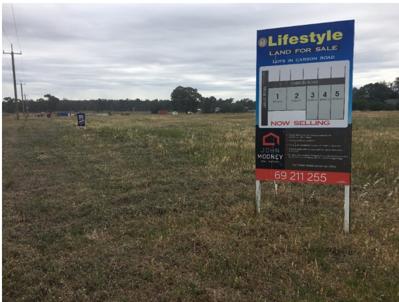
Carson Road Subdivision, The Rock