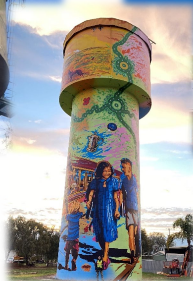
Yerong Creek Water Tower