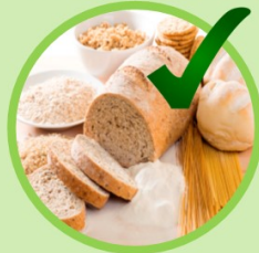
Grains & Pasta