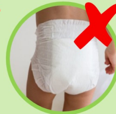
NO Nappies or wipes