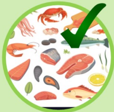
Fish & Shellfish