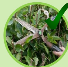
Yard Trimmings & Prunings