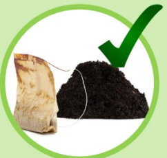
Coffee Grounds & Tea Bags