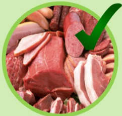
Meat & Bones