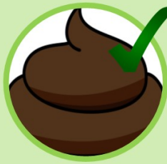
Unbagged Pet Litter