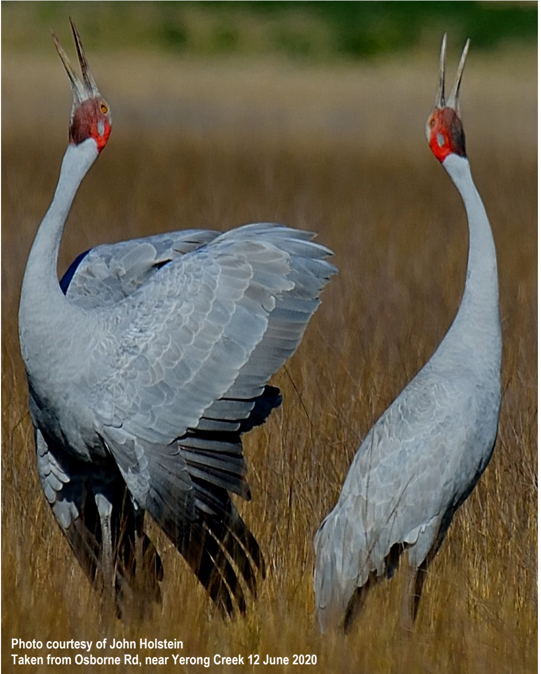
Taken from Osborne Rd, near Yerong Creek 12 June 2020