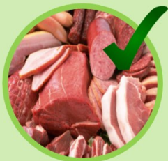
Meat & Bones