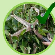
Yard Trimmings & Prunings