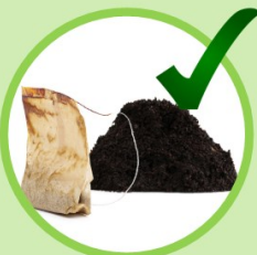
Coffee Grounds & Tea Bags