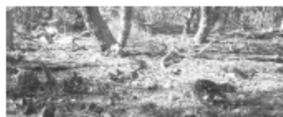
Spotted Quoll caught on one of our infrared cameras

We are looking for landholders in the Eastern Riverina to participate in a citizen science survey of the wildlife on their property. We will teach you how to set up a camera trap and then lend you a camera for two weeks so you can find out what animal species are on your land.