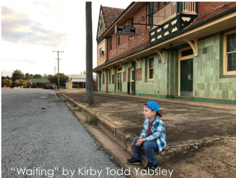
"Waiting" by Kirby Todd Yabsley