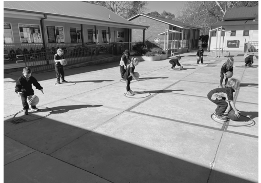
PEP COVID-19 style