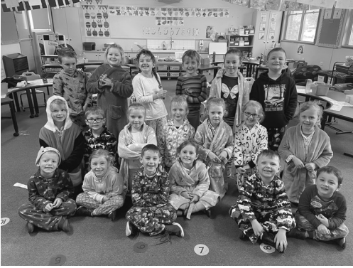
SRC Pyjama Day to raise funds for the New Sensory Garden.