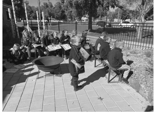
Alfresco lesson in the Indigenous Garden.