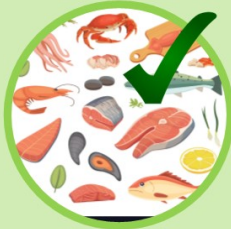
Fish & Shellfish