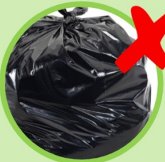
NO Household waste