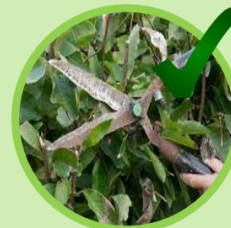
Yard Trimmings & Prunings