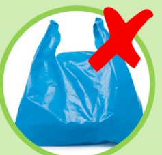
NO Plastic Bags