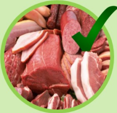
Meat & Bones