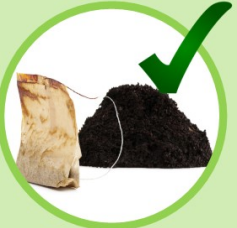
Coffee Grounds & Tea Bags