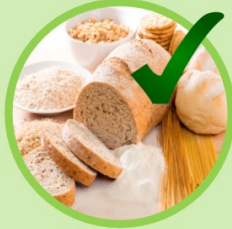
Grains & Pasta