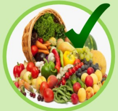
Fruit & Veggies