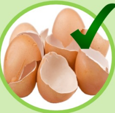
Eggs & Shells