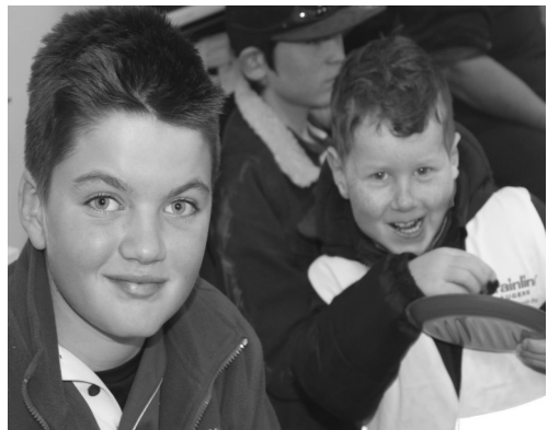
School Merit Awards