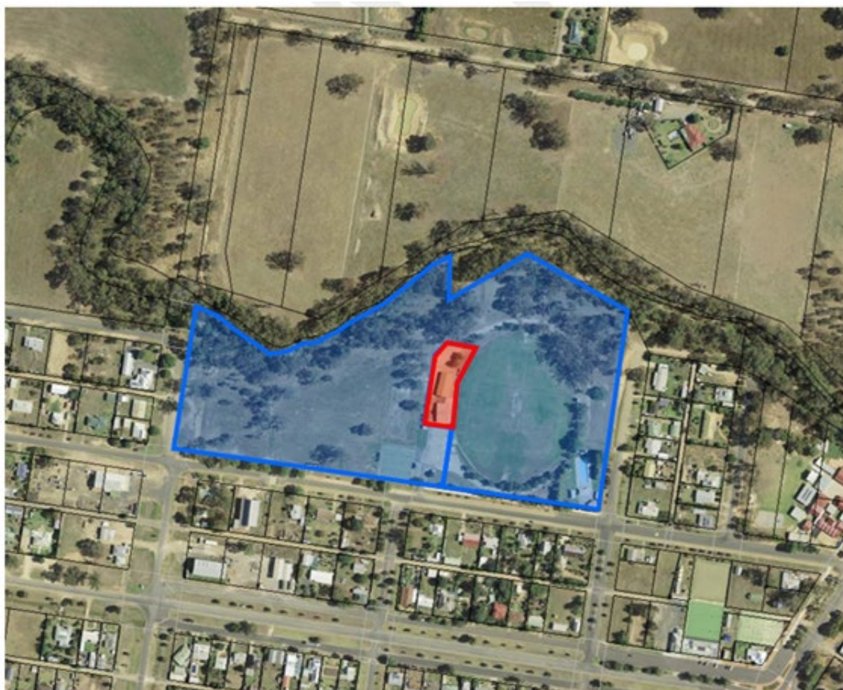
The Rock Recreation Ground – Sportsground (blue); General Community Use (red)

The amendments outlined above have now been made to the Draft PoM as well as to Appendix A - Inventory of Land and Council's endorsement of the amendments and authorisation to place the amended Draft PoM on public exhibition a second time is now sought.