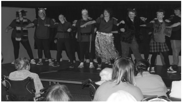
Celebrating Education Week 175 Years of Public Education