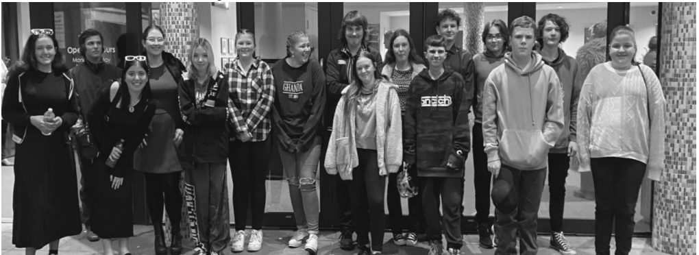
Civic Theatre – Bell Shakespeare's Twelfth Night. Secondary students were fortunate enough to be able to attend a performance of Twelfth Night at the Civic Theatre. This opportunity was subsidised by Lockhart Central School.