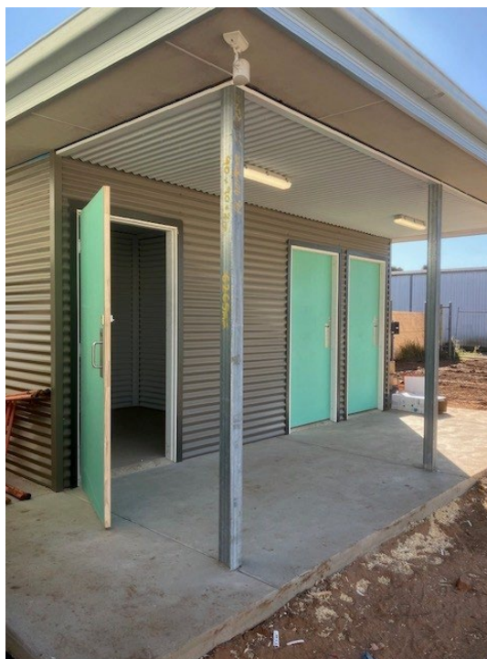
As part of the redevelopment of 109 Green Street, Lockhart, Council has installed public toilets at the rear, providing accessible toilet facilities in the main shopping area of the town.