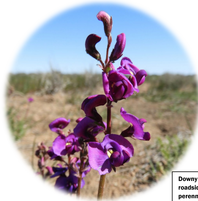
Downy Darling Pea ( swainsona swainsonioides ) found on a roadside in the western part of the Shire. This native, perennial herb is considered endangered in many areas due to habitat destruction.