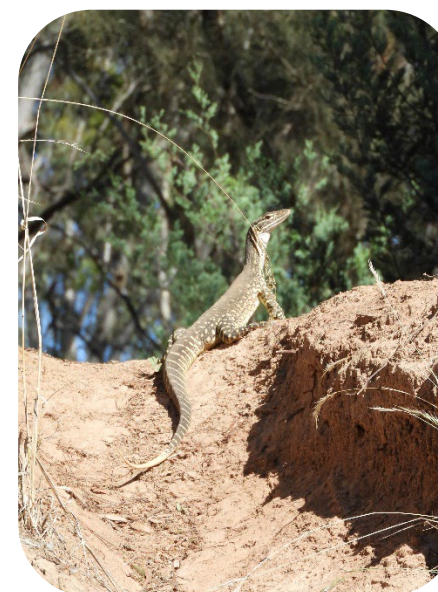
Juvenile Gould's Sand Monitor ( Varanus gouldii ), Braithwaites Travelling Stock Reserve.

Council provided rate relief to Pensioners during the financial year in the sum of $79,605.87. Council did however receive $43,783.23 in Pensioner Concession Rebate from the NSW State Government.