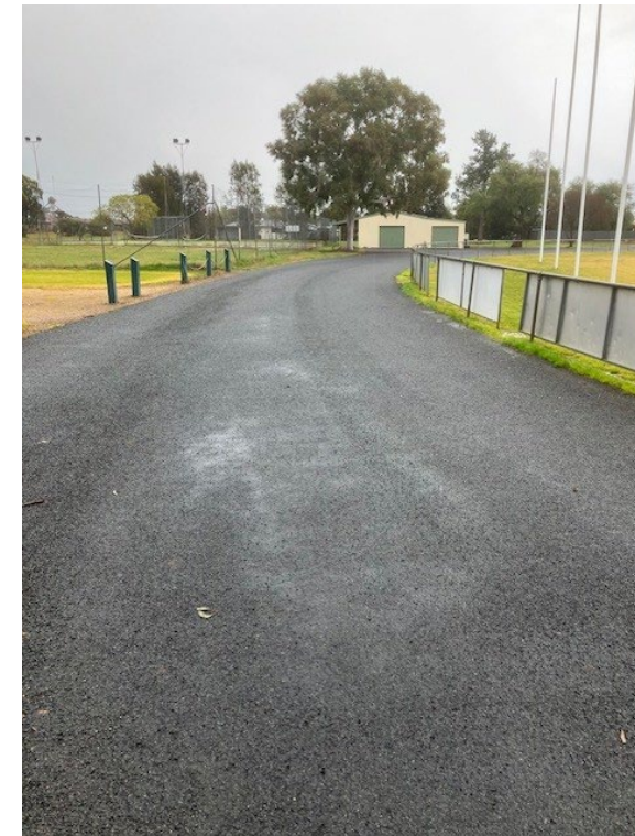
Access at Council's recreation grounds at Lockhart and The Rock was improved with bitumen sealing of the internal roads.

Not Progressing – projects that were scheduled to have commenced but have been delayed.